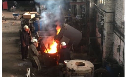
A bell being cast at John Taylors Bell Foundry - just out of interest this is one of the three new ones for St Mary's Beverley back in 2019

Our augmentation to eight bells will pick up a pace within the first three months of the year. In February we have John Taylor bell founders coming to survey the work. Taylors are our company of choice to cast the two new bells. Our original six bells are all Taylors, cast by them back in 1919 and we feel it is important to keep new bells with the same profile as our existing ones, along with their head stocks, plus it is widely thought in ringing circles that Taylors do cast and tune the best bells in the world.