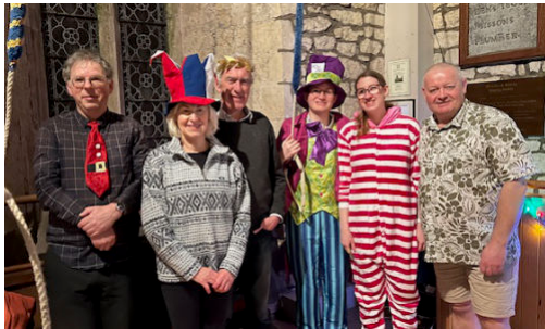
The Midnight Bell crew in fancy dress!

Following some light liquid refreshments, again in the White Hart, six of us rang in the New Year at midnight, fancy dress and all, and for the second year we were also joined by some non-ringing spectators within the ringing chamber, which is always a joy for us.