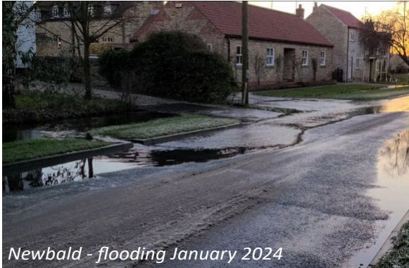
Newbald - flooding January 2024

We are not sure what Yorkshire Water plan to do about this, but it is interesting to note that when the same issue happened in Newbald in 2020, YW's response was to line the sewers, at a cost of £ half a million 'to prevent ingress of ground water in the waste water system'. As far as the good people of Newbald are concerned this winter, that has proven to be a waste of money. There is simply too much water getting into the the sewer system for it to cope. But let's be clear - that is not because